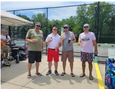
The Cornhole Champs!